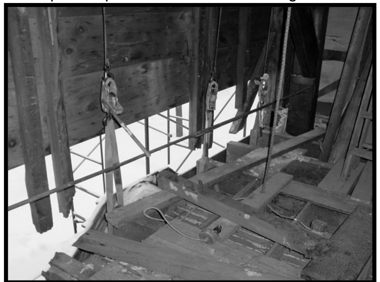
Girt removed. Rafters suspended by cables.