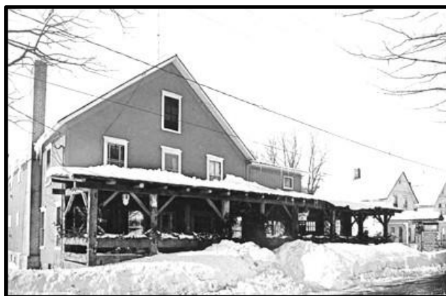
Postcard of Wedel Inn Postmarked March 1969