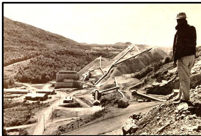
ca.1960 Company Publication

We recently accessioned information on the asbestos mine operated out of Lowell and Eden. It was in operation from 1901 until 1993 before closing down. It was owned by its workers for the last 20 years. In 1976 about 20% of Montgomery's working age men worked there, with a company bus providing transportation daily.