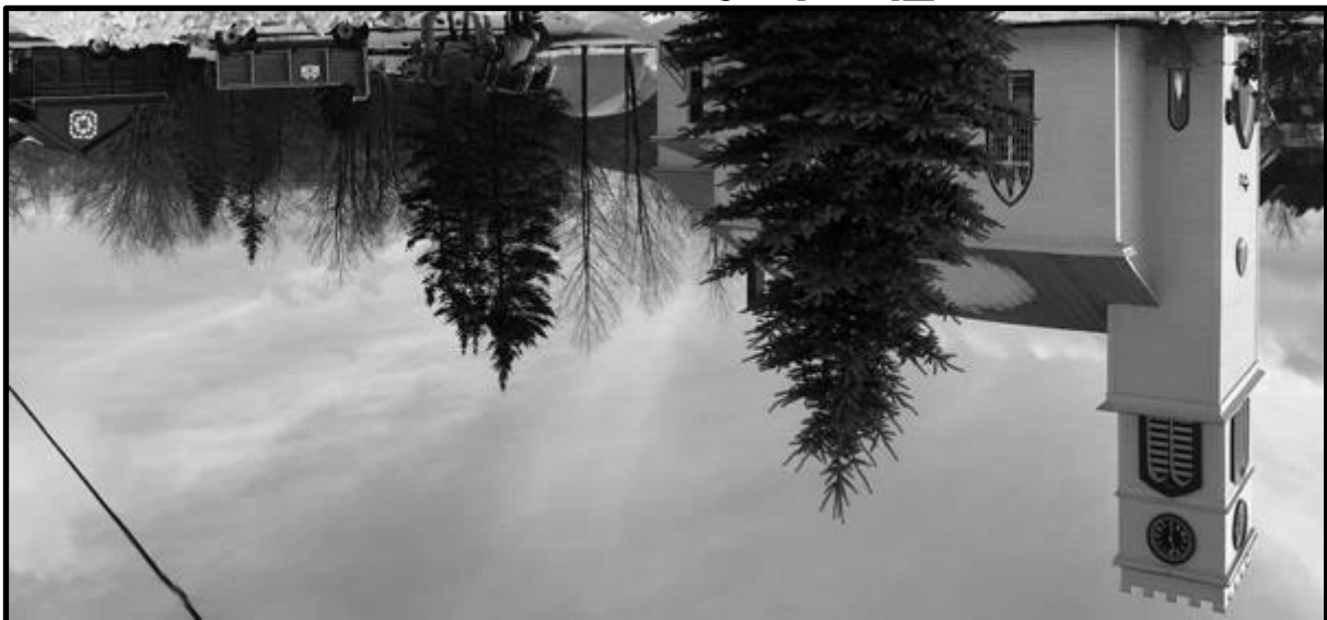
Horses being hitched at Pratt Hall