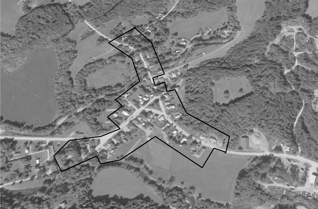
Approximation of Center Historic Districts