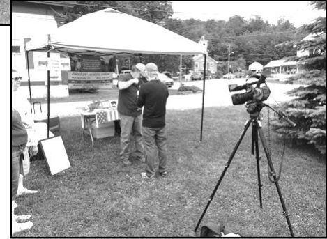
Prepping for CCTV Interview