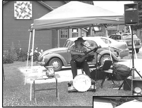
Papa Grey Beard Music for Baby Boomers