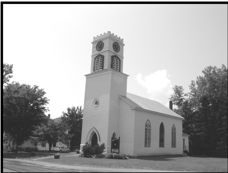
Structural Repairs Complete Pratt Hall June 2011

Having said that, we must keep our numbers up to remain eligible for 2012. If you are already our Affinity partner you don't need to do anything. If not and you want to, just contact your nearest TD Bank. There are links on our web site with more information.