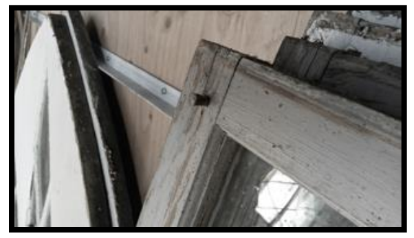
Peg in Sash Tenon