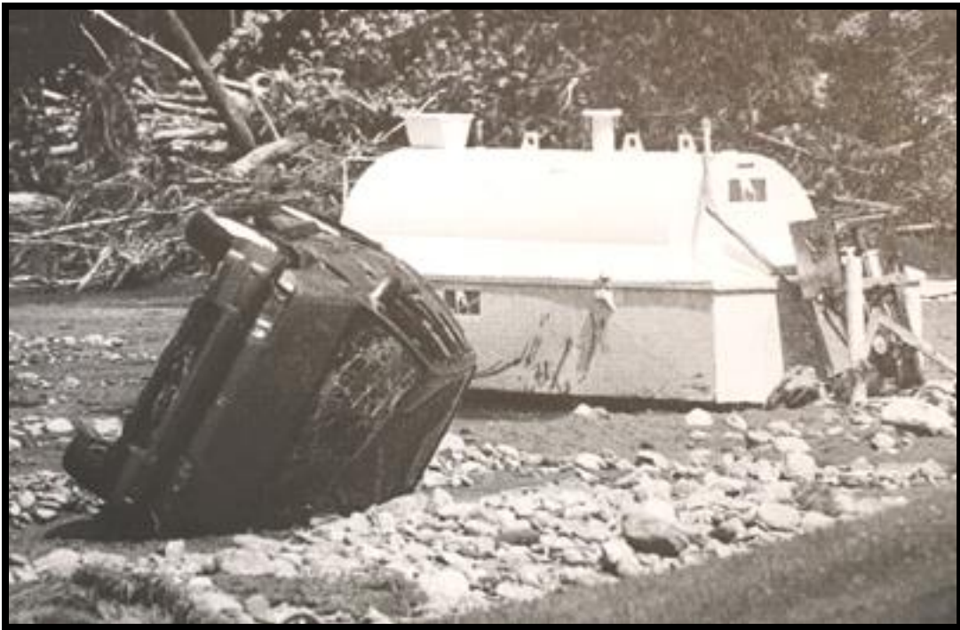
Village Flood Damage

July 1997: Montgomery devastated by a historic flood. Estimated damages to public infrastructure estimated at 7.5 million predominantly in Montgomery. Selectmen report ;