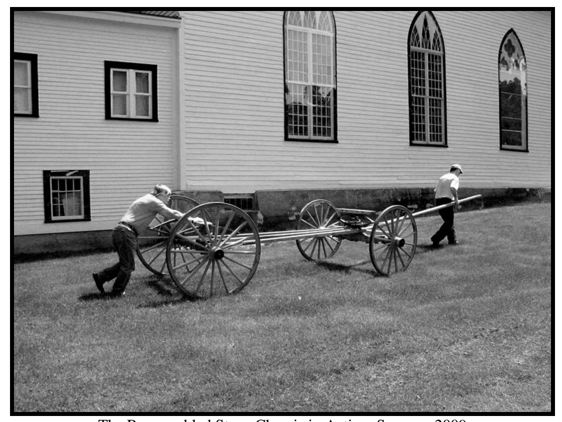
The Reassembled Stage Chassis in Action, Summer 2009

If you have any knowledge, stories, pictures, or connections to the Montgomery stages we would love to hear from you. We would like to restore the stage's deck and canvas cover at some point when resources and expertise allow, and we can figure out where to store it out of the elements.